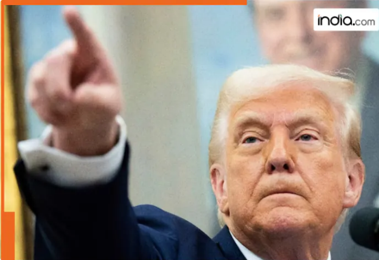
Bad news for Indians students, H-1B visa holders as US govt decides to shut down..., set to affect...

US H-1B Visa: United States President Donald Trump is giving shock after shock with his decisions. Recently, he decided to shut down three important monitoring agencies, including the Office of the Citizenship and Immigration Services (CIS) Ombudsman's Office. According to immigration attorneys, this decision by the Trump administration has come as a major shock to the Indian community, especially for those who are working in America on H-1B visas and studying on F-1 visas. These people used to get a lot of help from the Ombudsman's Office, but now, with the closure of the office, there will be no one to help them.