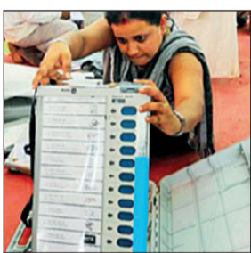
IN LARGER PUBLIC INTEREST