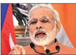
Modi's defence of the move came two days after RBI released data showing 99% of scrapped notes had come back

Addressing top officers at the annual retreat for tax administration, he said that the government is working to