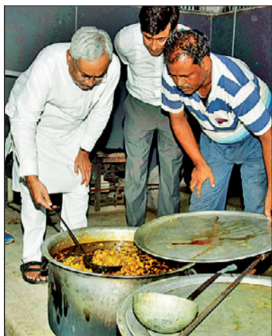
WHAT'S COOKING? Bihar CM and JD(U) leader Nitish Kumar at a flood relief camp in Purnea district last month. A split in Congress would give Nitish a cushion

Besides the consideration of portfolios and privileges, some Congress MLAs are said to be keen to bolt also because of the pressure of their upper