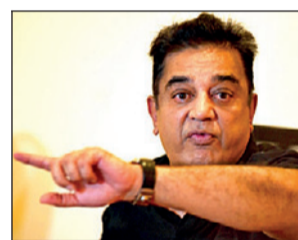
NO RIGHT TURN: Kamal Haasan

Thiruvananthapuram: Amid indications that he may join politics, veteran actor Kamal Haasan on Friday addressed the issue of his political affiliation, saying his colour is "definitely not saffron".