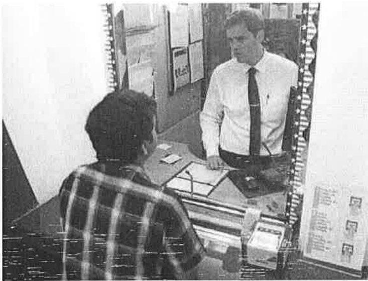
File photo used for representation

MUMBAI: Many H-1B visa holders could find themselves facing deportation proceedings if their application for a visa extension or change of status has been rejected and the tenure of stay granted originally by the US authorities (as reflected in Form 1-94) has expired. To make matters worse, despite no longer holding on to a job, they would have to stay on in the US for several months, waiting to be heard by an immigration judge.